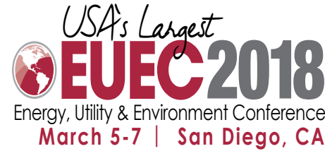
EXHIBIT BOOTH PACKAGE INCLUDES: